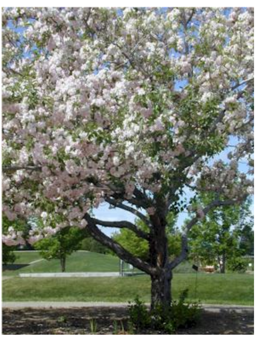
Approximate tree size reference 10' 14' 20'