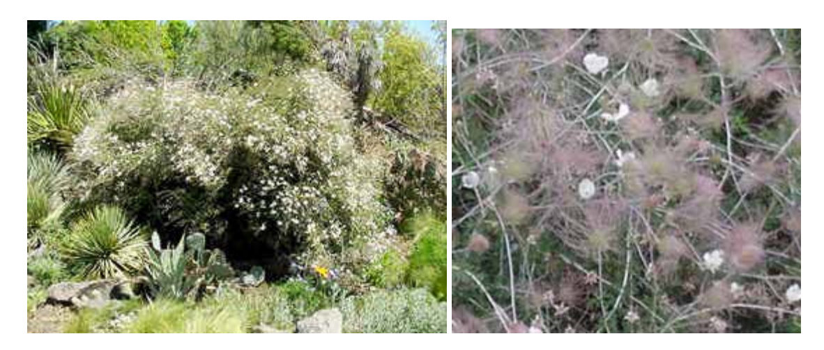
<u>Cliff Rose</u> (Cowania mexicana stansburiana) Evergreen shrub with ridged, gnarled branches and tiny "toothed" leaves. Fragrant creamy yellow flowers ½" wide followed by tiny fruits seeds with long feathery tails. Mature height 6'; spread. XXX-rated.

Apache Plume (Fallugia paradoxa) Semi-evergreen shrub. Small grey green lobed leaves on graceful arching stems; straw colored branches with shredded bark. Spring/summer flowers resemble single white roses 1 ½" wide. Feathery pinkish seed heads follow to create soft-colored changing "haze" through which you can see the shrub's rigid branch pattern. Needs gritty, well drained soil; pruning usually not needed. Mature height 4-6'; spread 5'. XXX-rated.