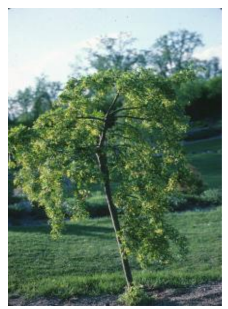
CARAGANA ARB. 'WALKER':

<u>Sutherland Caragana</u> (Caragana arborescens) Also known as Peashrub. Unique v-shaped multi-stemmed tree/shrub with upright narrow growth. Well adapted to extreme conditions (heat, cold, dry, windy, etc.) Bronze-yellow bark, leaves divided into small leaflets. Yellow flowers in spring resemble sweet peas. Consider planting site as this plant does have thorns. XXX-rated.